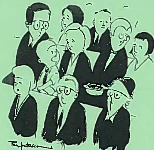
"I PUT IN MY CANADIAN QUARTER... FOR FOREIGN MISSIONS."

The only reason some people get lost in thought is because its unfamiliar territory.