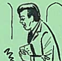
Be an Earnest Pray-er