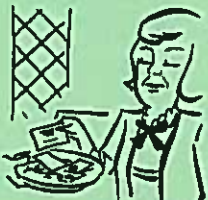
Be a Cheerful Giver