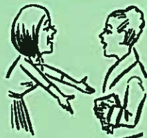
Be a Friendly Greeter