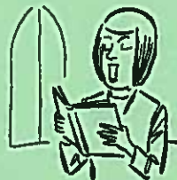
Be a Hymn Singer