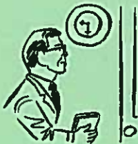
Be an On-Timer