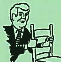
Be a Willing Helper