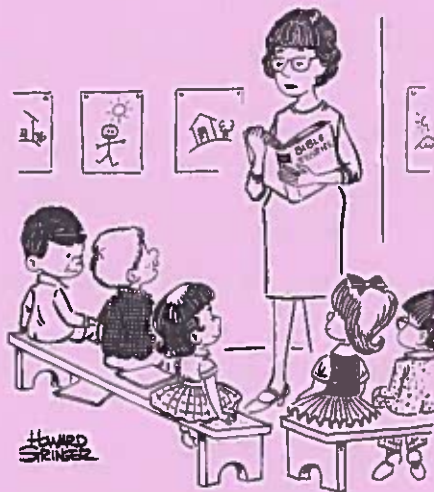
Read us the story about the guy who let his girlfriend give him a haircut.